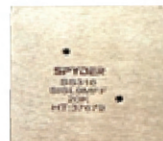
¼"-1" 316 SS 15K-60K FxF BLOCK ELBOW