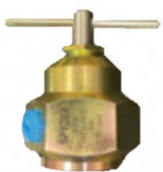
1" X 14 UNSF WITH 1/2" NPTF VENT A105 15K PRESSURE RELIEF TOOL