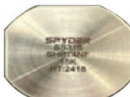
¼"-1" 316 SS 15K-60K FxFxF PUCK STYLE TEE