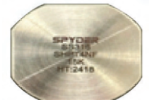
¼"-1" 316 SS 15K-60K PUCK STYLE ELBOW