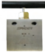
¼" -1" 316 SS 15K-60K TWO-WAY FxF ANGLE NEEDLE VALVE