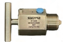
9/16" OD HP M X 1/8" W/ DRAIN 316SS 15K GAUGE ADAPTER