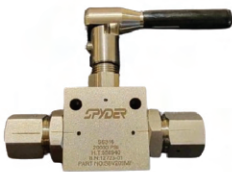
¼"-1" 316SS 15K-30K 2-WAY/ 3-WAY BALL VALVE