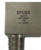
¼"-1" 316 SS 15K FxF ELBOW