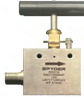
¼"-1" 316 SS 15K TWO-WAY MXF NEEDLE VALVE