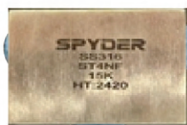
¼"-1" 316 SS 15K-60K FxFxF BLOCK STYLE TEE