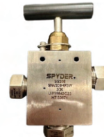
¼"-1" 316 SS 15K-60K THREE-WAY NEEDLE VALVE